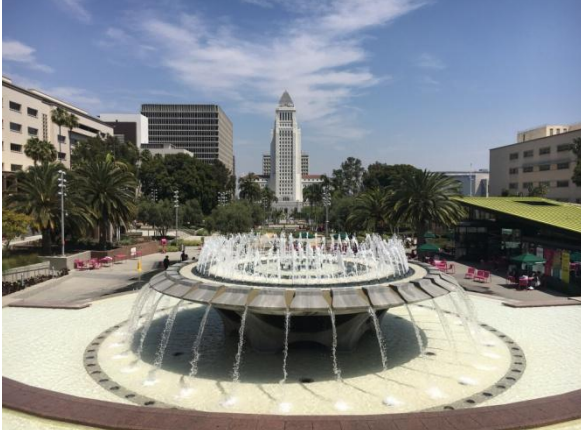
AIDS Walk Los Angeles Reveals New Downtown Route for October 23 Event 32<sup>nd</sup> annual AIDS Walk Los Angeles starts and ends in Grand Park and raises critically needed funds for APLA Health

(Los Angeles, CA; September 21, 2016)—<u>AIDS Walk Los Angeles</u> unveils a new <u>route</u> for this year's event, which takes place Sunday, October 23. The 10-kilometer (6.2-mile) walk will begin and end in Grand Park, located in the heart of Downtown Los Angeles, and the route will take walkers past such historic and architecturally rich landmarks as the Walt Disney Concert Hall, the Dorothy Chandler Pavilion, the Broad Museum, the Japanese American Museum, and many others.